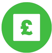
In App purchasing